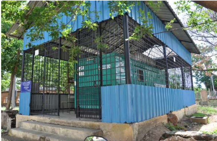
24 x 7 Uninterrupted Power Supply