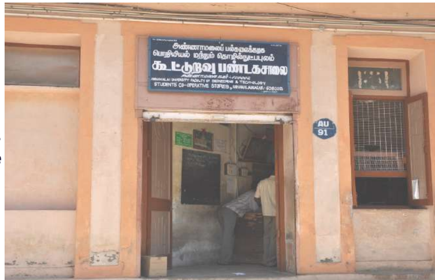
Student's Co-op Store