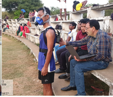
Strength & Conditioning Lab