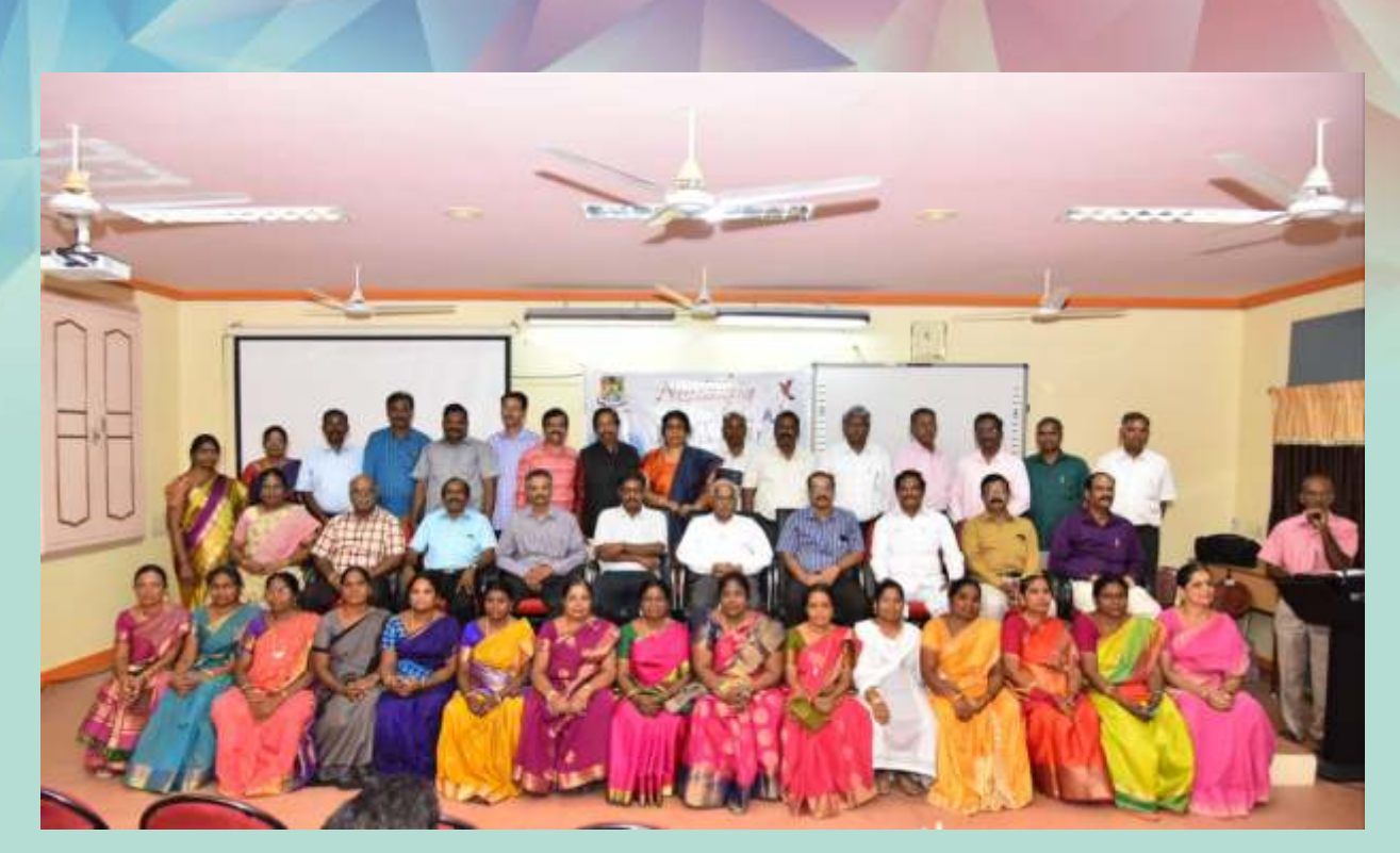
Alumni meet of 1985-87 batch of M.Sc.,(Zoology)