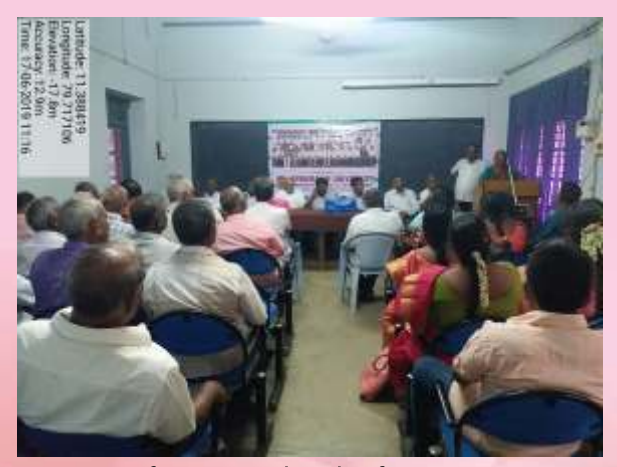
Reunion of 1977-79 batch of M.Sc.(Botany) held in the Department of Botany