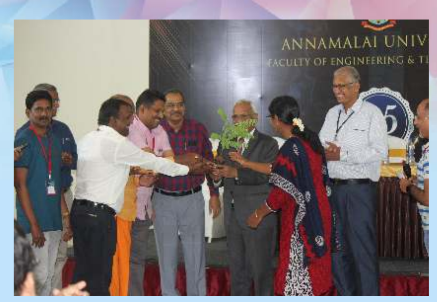
1994 batch of Engineering and Technology donating tree sapling to transform FEAT as Green Campus during their get together