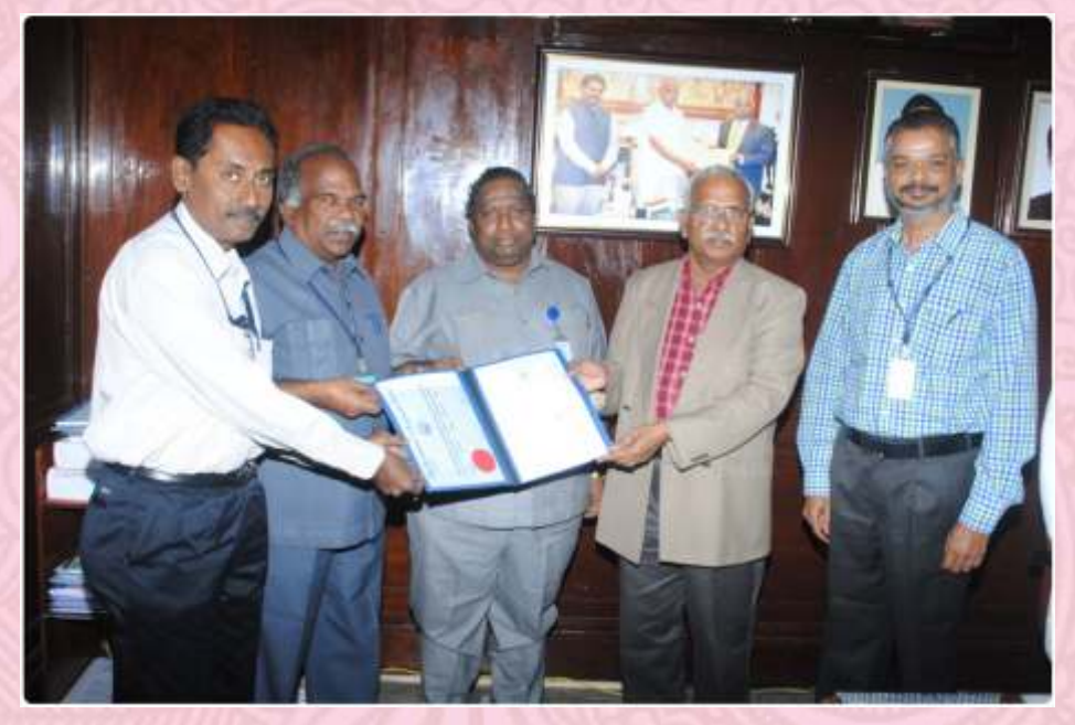
Annamalai University Alumni Association donated Rs.1,77,000/for the institutional membership in Institution of Engineers India (IEI)