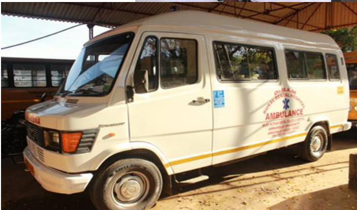
Mobile Dental Unit