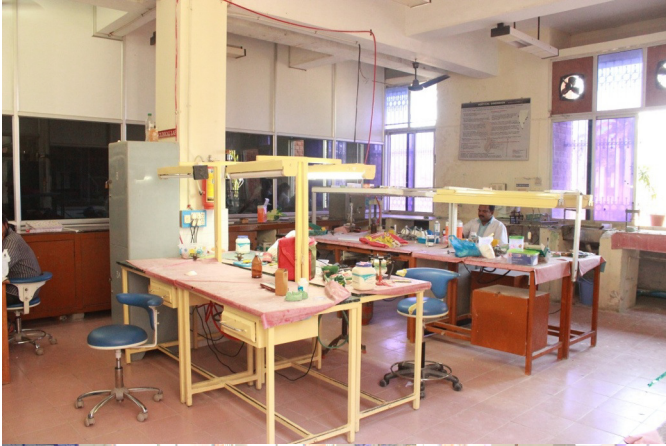
Prosthodontics P.G. Lab