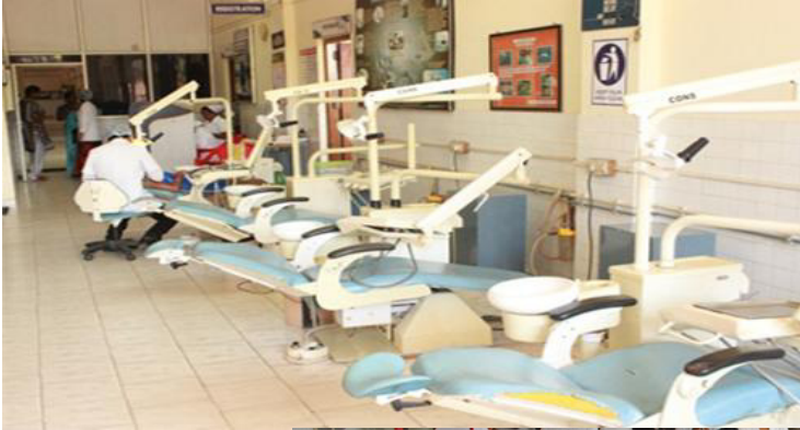
Endodontics U.G. Clinic