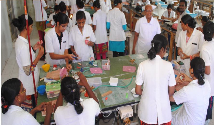
Prosthodontics Preclinical & Clinical Lab3