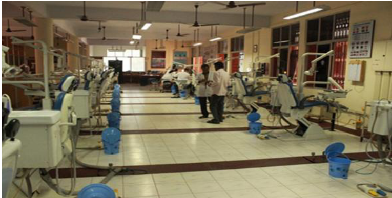
Periodontics P.G. Clinic