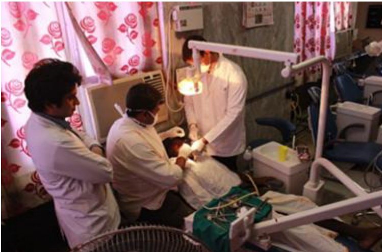
Minor Operation Theatre