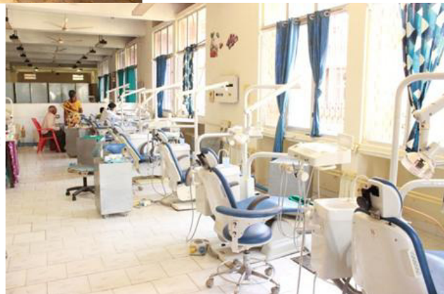
Pedodontics P.G. Clinic