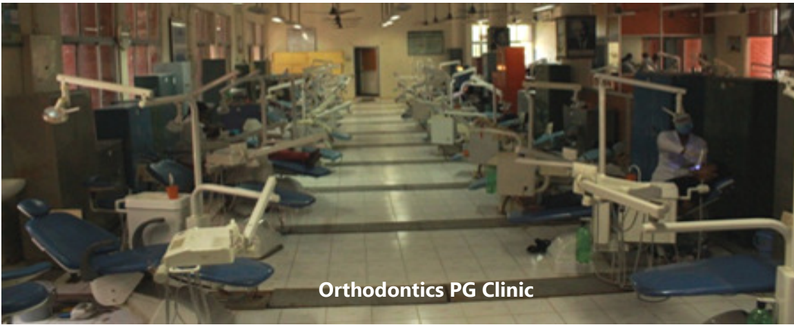
Orthodontics PG Clinic