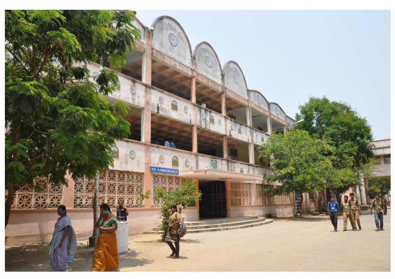
Class Rooms Platinum Jubilee Block