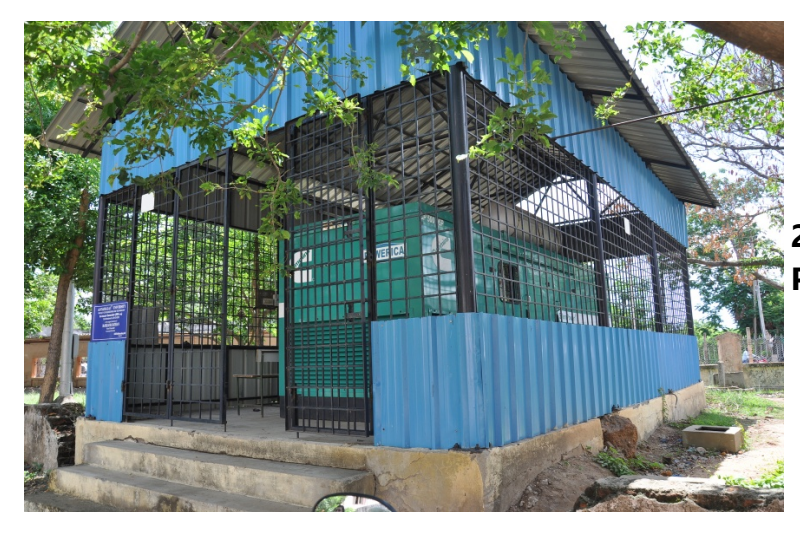
24 x 7 Uninterrupted Power Supply