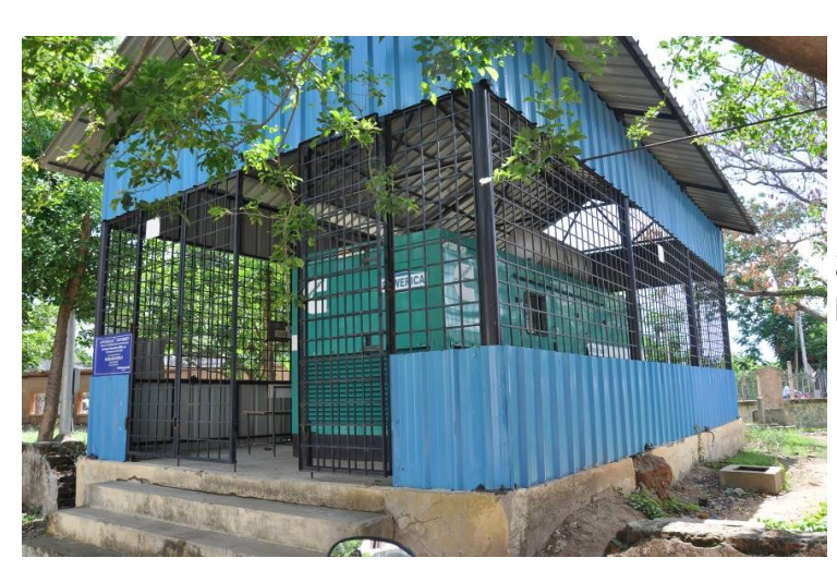
24 x 7 Uninterrupted Power Supply