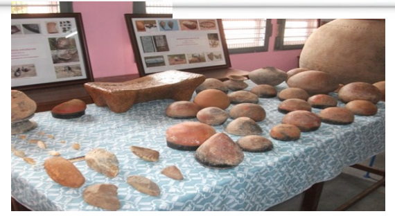
Archaeological Findings in the Museum