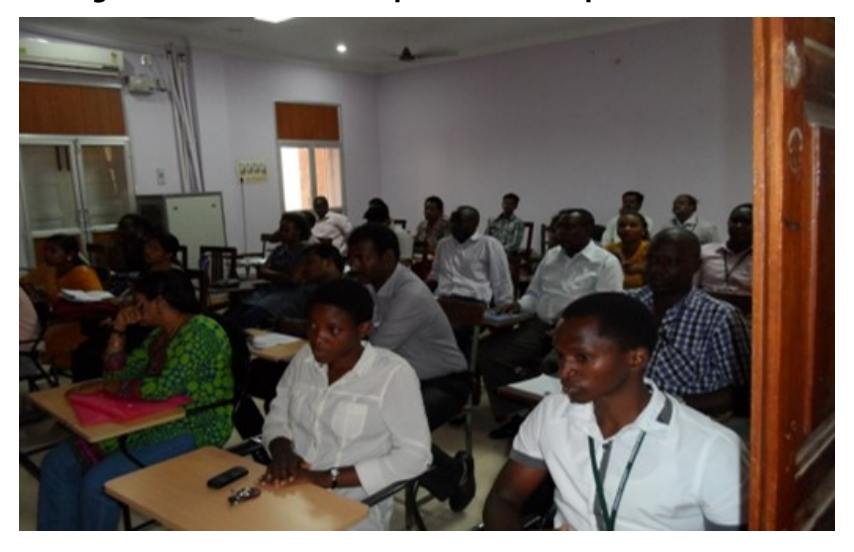
Hands-on Practice at the Departmental Computer Lab