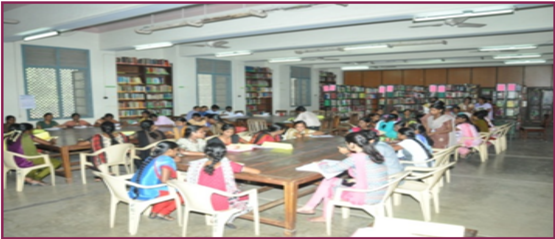
C.P. Ramaswami Aiyar Library