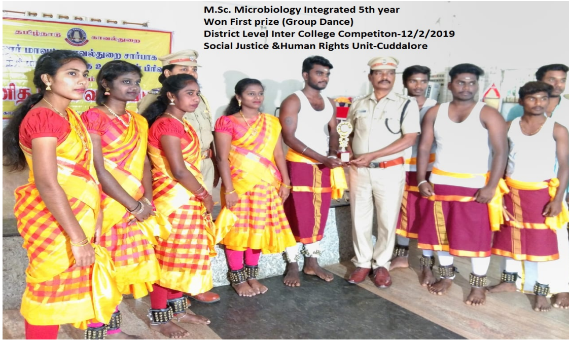
M.Sc. Microbiology Integrated 5th year Won First prize (Group Dance) District Level Inter College Competition-12/2/2019 Social Justice & Human Rights Unit-Cuddalore