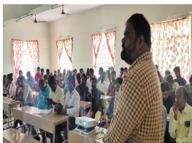
Coaching Class for Civil Service