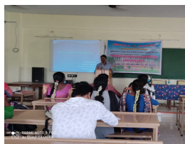
Lecture for Competitive Examinations