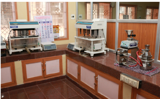
Jet Mill and Dissolution Test