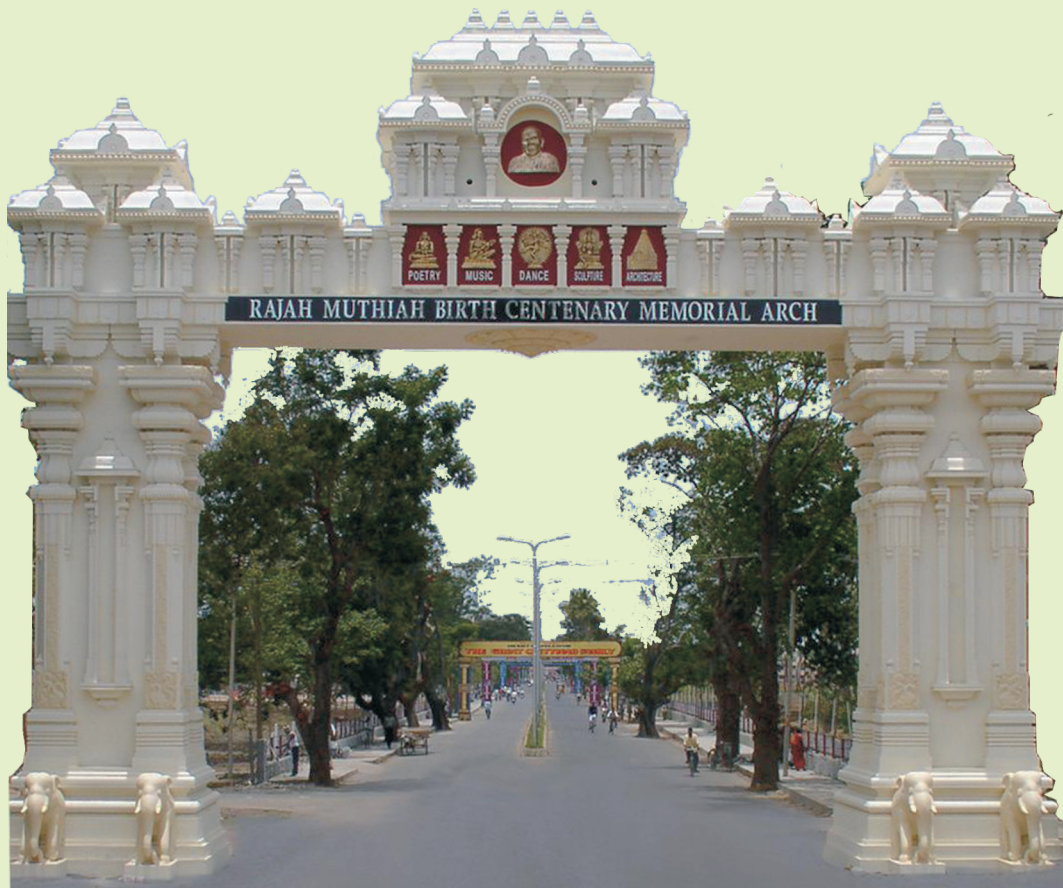
Rajah Muthiah Birth Centenary Memorial Arch