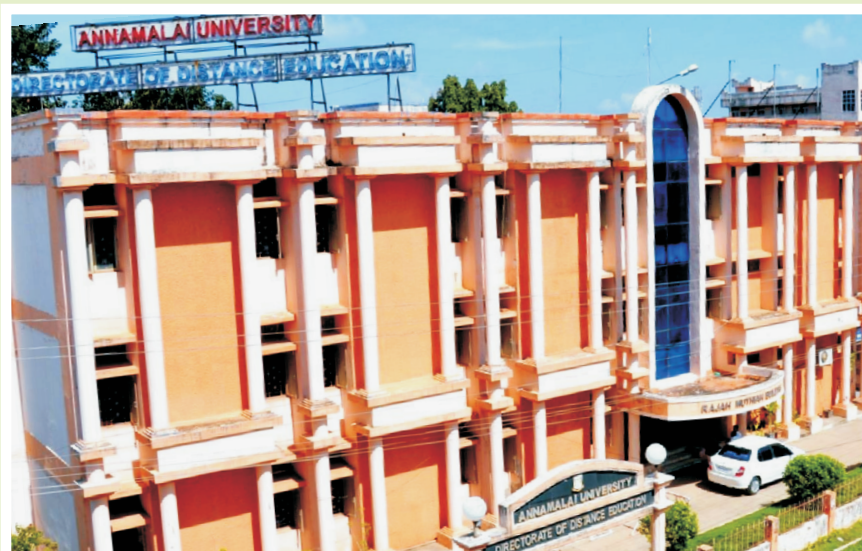
Directorate of Distance Education