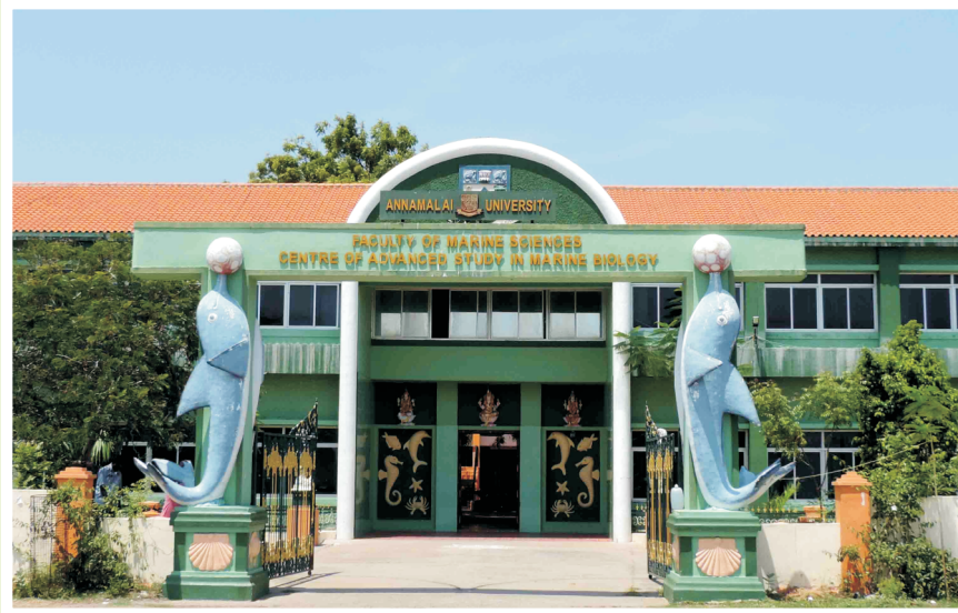
Faculty of Marine Sciences