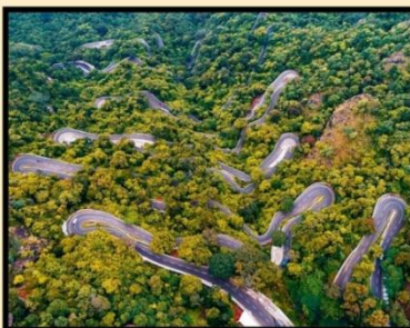
Yercaud (201 km)