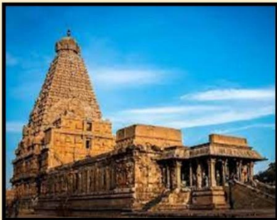
Brihadeeswarar Temple (124 km)