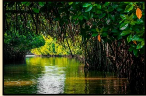
Pichavaram Mangrove forest (13 km)