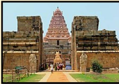
Gangaikonda Cholapuram Temple (43 km)