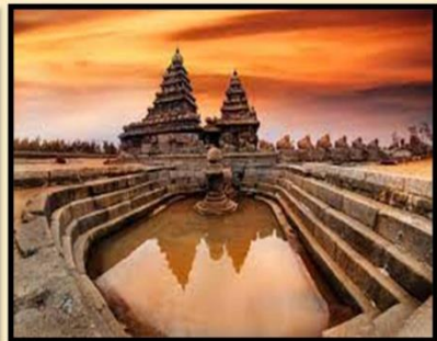
Shore Temple, Mahabalipuram (160 km)