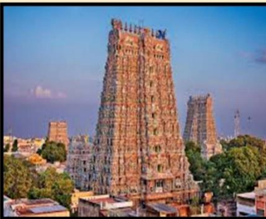
Ranganathaswamy temple, Trichy (145 km)