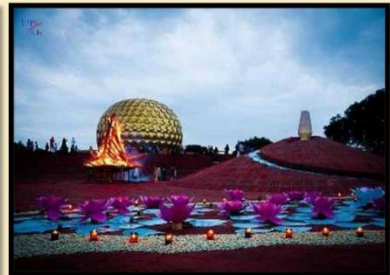
Auroville, Pondicherry (76 km)