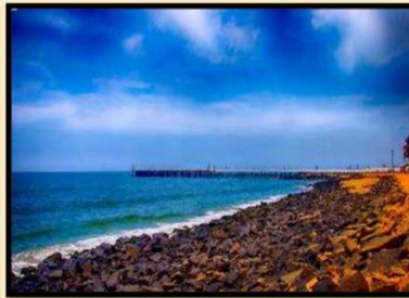
Promenade Beach, Pondicherry (65 km)