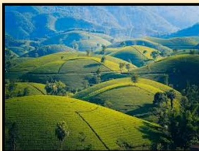
Kodaikanal (346 km)