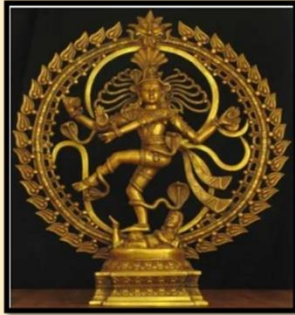
Thillai Nataraja Temple, Chidambaram (2 km)