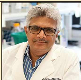
Suresh V. Ambudkar National Institute of Health, USA