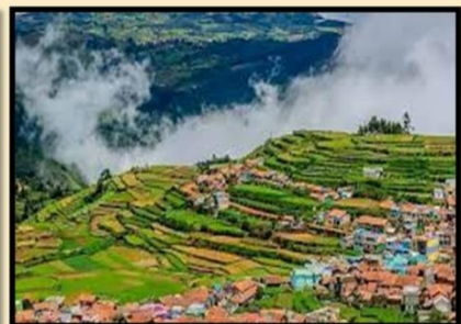
Ooty (391 km)