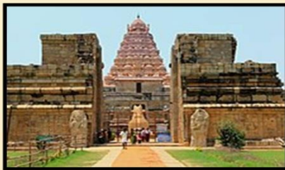
Gangaikonda Cholapuram Temple (43 km)