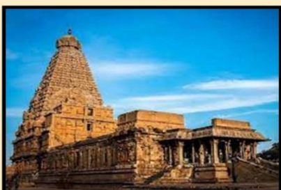
Brihadeeswarar Temple (124 km)