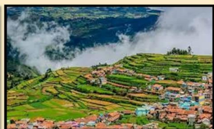
Ooty (391 km)