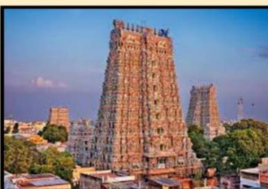
Ranganathaswamy temple, Trichy (145 km)