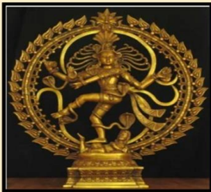
Thillai Nataraja Temple, Chidambaram (2 km)

Chidambaram is all about relishing nature's beauty and soaking up the spiritual ambiance. A beautiful temple town in the Cuddalore District of Tamil Nadu, Chidambaram is famous for housing the marvelous and spectacular Lord Nataraja Temple. It has been ruled by several dynasties over time namely Cholas, Pandyas, Vijayanagar rulers, Marathas, and the British. Due to cultural influences, it boasts of a rich heritage and traditions. Apart from its authentic history, the town is a slice of paradise for nature lovers and bird watchers. Pichavaram backwaters are one of the many highlights of this region. Pondicherry is another tourist attraction which is a quiet little town on the southern coast. The town has quaint colonial heritage buildings, a spiritual scene, and beautiful beaches.