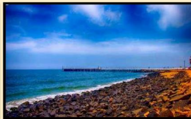
Promenade Beach, Pondicherry (65 km)