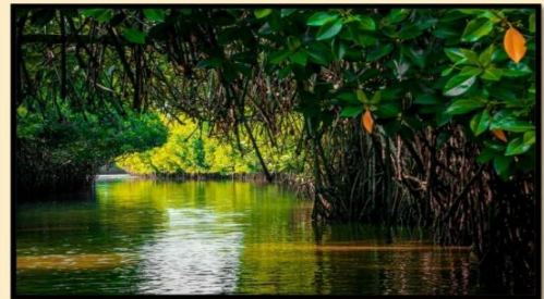
Pichavaram Mangrove forest (13 km)