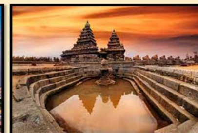
Shore Temple, Mahabalipuram (160 km)