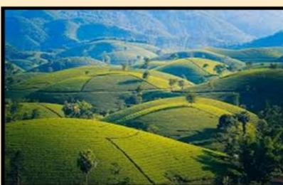
Kodaikanal (346 km)