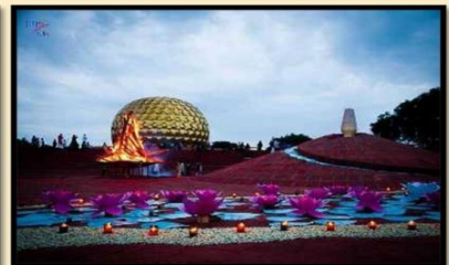
Auroville, Pondicherry (76 km)